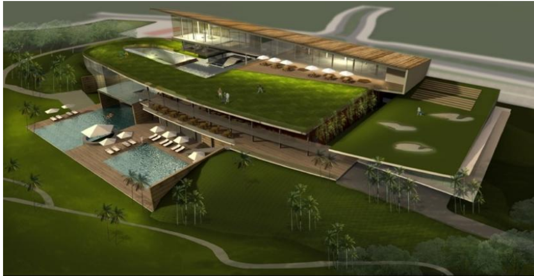
proposed son my golf club house, ham tan, vietnam

A luxury golf resort with the site area ~ 377ha with a 5 stars Golf Club building (8,000sqm.) and 400 villas. Project functions: Spa, Restaurant, Café, Swimming pool ..